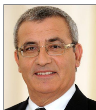
The Hon Evarist Bartolo