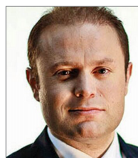
The Hon Dr Joseph Muscat