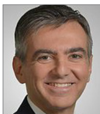
The Hon Dr Simon Busuttil